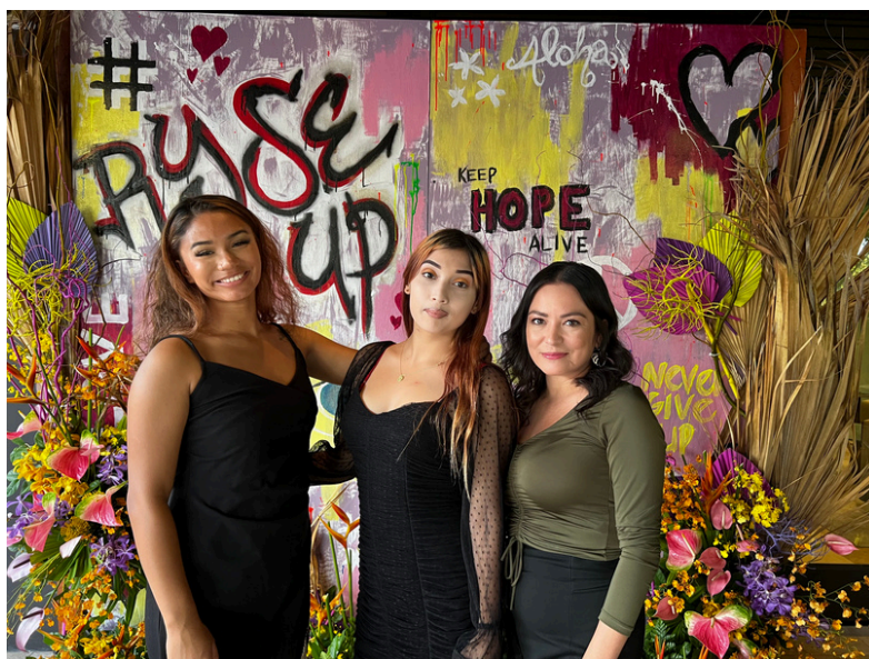
Journey of RYSE - 2023 Fundraiser